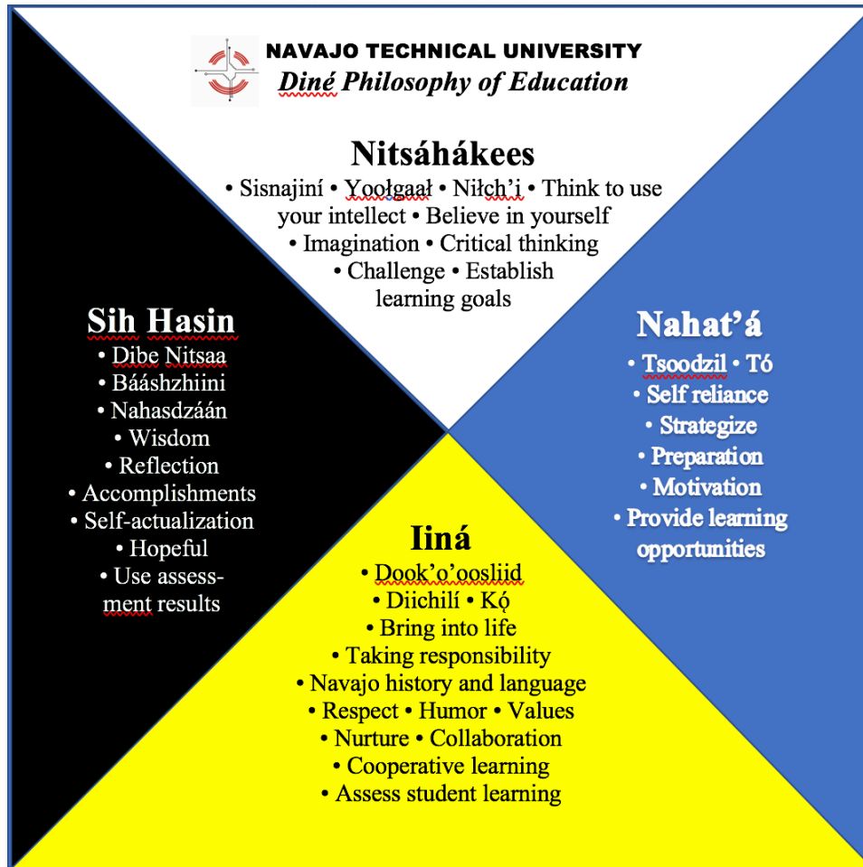
FIGURE ONE: Diné Philosophy of Education at Navajo Technical University

Every degree and certificate program at NTU should have a student learning plan that operationalizes the Life Principles of Diné Philosophy of Education (see Appendix 1 ). The plan's focus is program-level learning, as opposed to class-, course-, or institution-level. What do faculty want the students to know, be able to do, and value and believe by the time they graduate? This is the focus. The plan describes the program's mission, student learning outcomes, measures for gathering data on student learning, and relationship of outcomes, courses, and measures. These program elements, along with assessment data and notes pertaining to analysis and program improvements, are archived by the faculty using online tools.